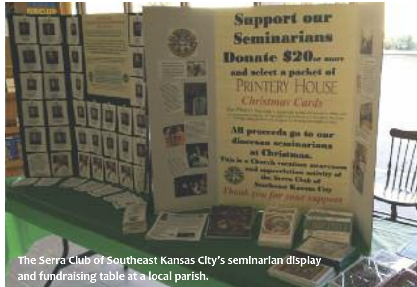
The Serra Club of Southeast Kansas City's seminarian display and fundraising table at a local parish.

Southeast Kansas City Serrans created five simple yet attractive displays bearing the pictures of all seminarians in their diocese. Two of these are on permanent display in two parishes. The other three are traveling displays that