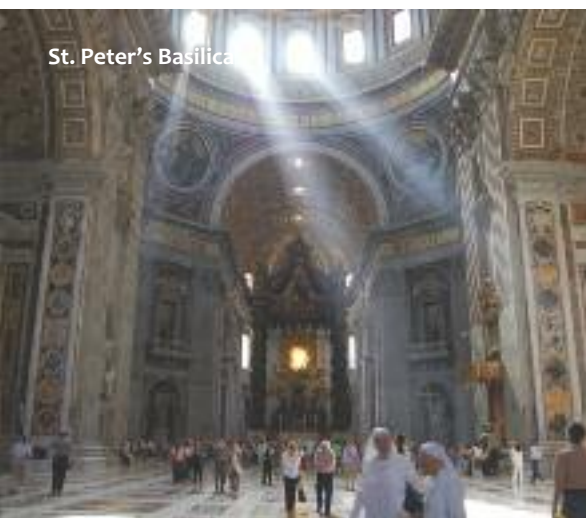
St. Peter's Basilica